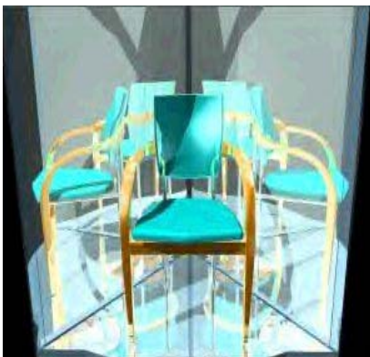
Image Contest 2001 has been redesigned to give more ICCON members, and SDRC associates, the opportunity to show off their talents with I-DEAS, with the added benefit of featuring the power of the software. Image Contest 2001 features categories for Solid/Assembly Modeling, Simulation, Imageware, Manufacturing, Unlimited/Artistic, and SDRC. Each category will be judged individually, with prizes for the top 3 winners for each category.

Last year's Image Contest entries included the overall winner above by whoever won, plus "Battle Droid R&R" by Dave White of Lexmark (middle column),